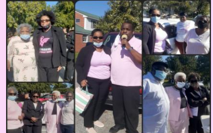
Breast Cancer Awareness Celebration Sunday October 18, 2020